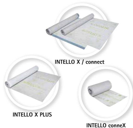
INTELLO X / connect